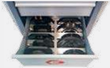
CRp Flange Drawer Organizer (max. 1 pc per trolley)

Ideal workshop organizer to fit most parts of the machine like harnesses, hoses, adapters, tools and flanges. Can be easily transformed to a Cambox and/or pump rack for easy transfer and storing.