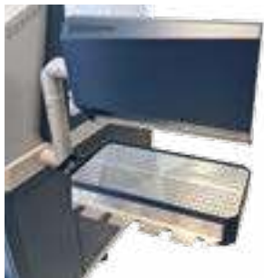
1 Desk & Harness Shelf