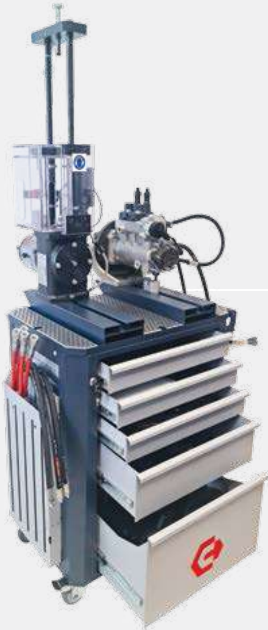
Carbon Zapp Trolley Fully Configured Setup