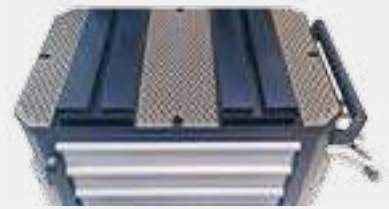
Cambox/Pump Transfer Rack (max. 2 pcs per trolley)