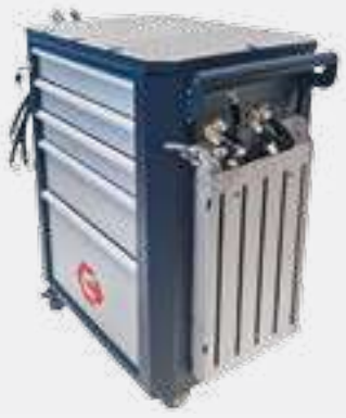
Hose & Harness Side Organizer (max. 2 pcs per trolley)