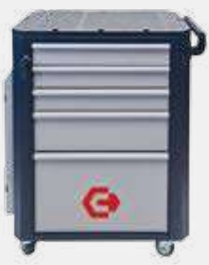
CZ Base Trolley